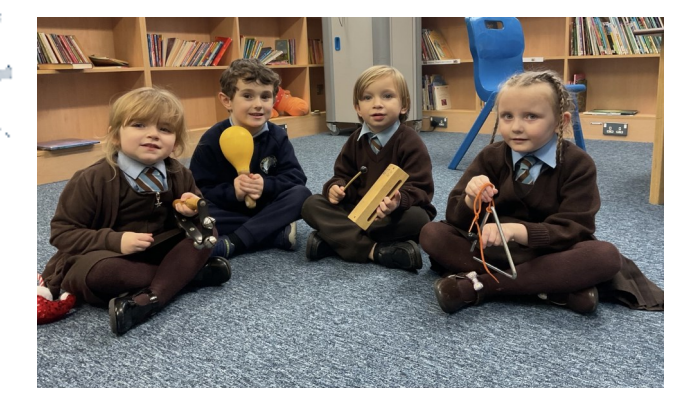
Singing songs and playing instruments.