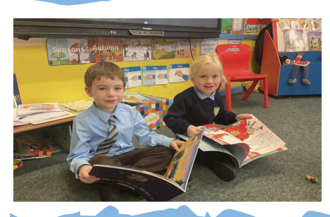
Reading together and sharing books.