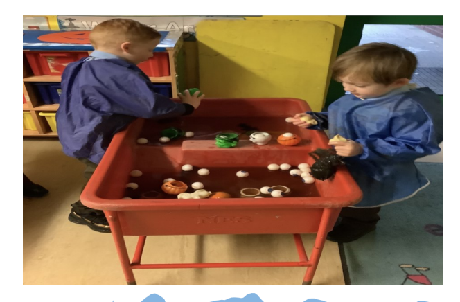
Water play fun and discoveries.