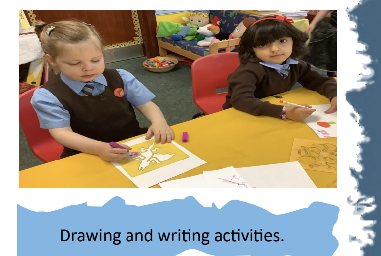
Drawing and writing activities.