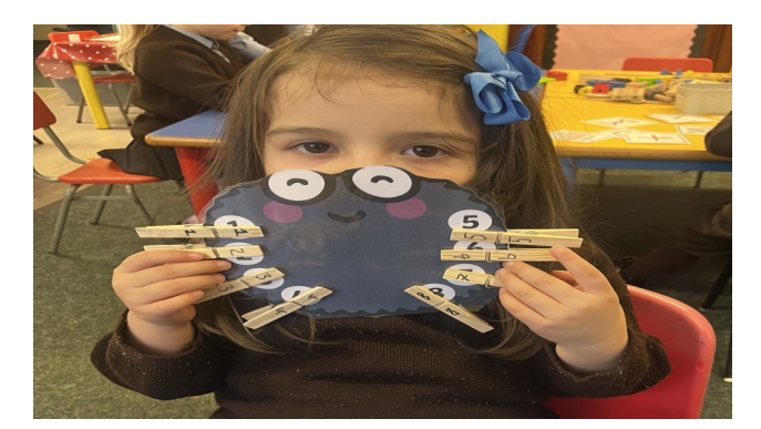
Counting and learning numbers.